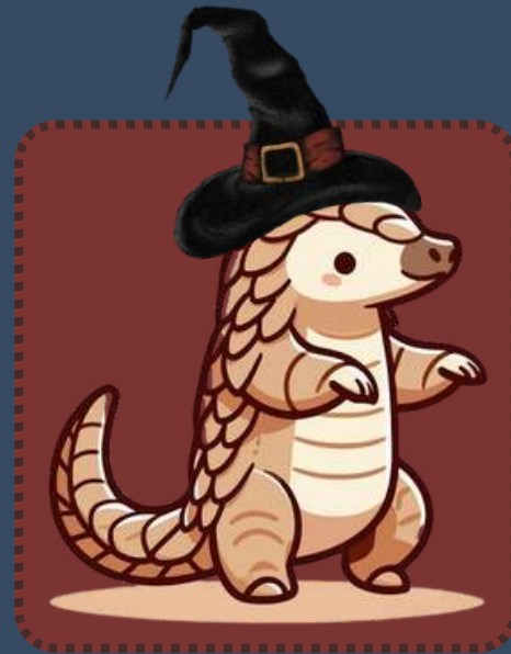
Penny the Pangolin UHP'S UNOFFICIAL MASCOT

"Luck favors the prepared darling!" ~ Edna Mode from "The Incredibles"