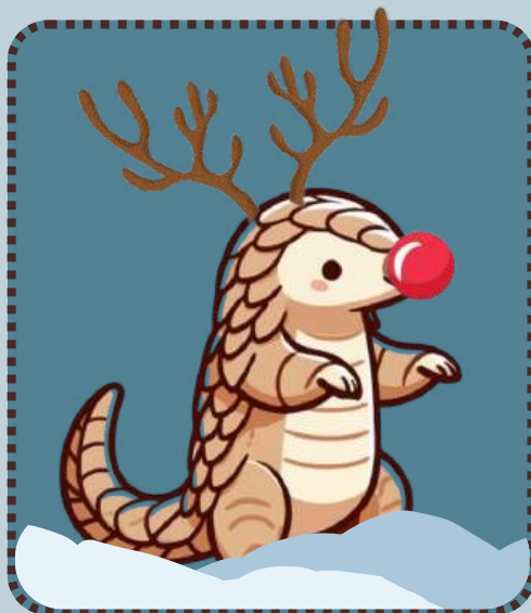
Penny the Pangolin UHP'S UNOFFICIAL MASCOT

Remember to check with your professors for when your Final Exams are taking place!