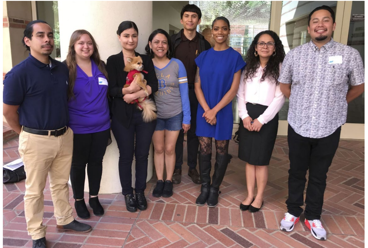
2019 UCLA Sally Casanova Scholar's Summer Research Cohort