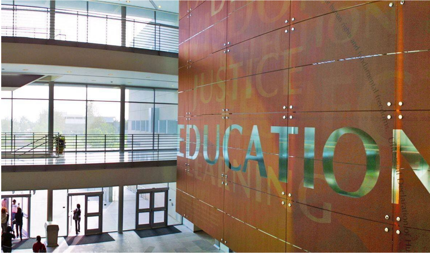
The CSUSB College of Education atrium.

The Department of Educational Leadership and Technology at Cal State San Bernardino houses the sole provider of career and technical education (CTE) programs in California. Students, whether they are community college instructors/administrators, police officers, firefighters, prison guards, nurses/other hospital staff, military personnel, or human resource trainers, are exclusively returning students (adult learning professionals).