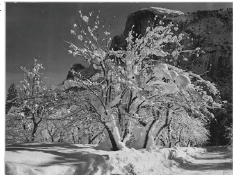
Half Dome, a famous rock formation in Yosemite. Photo by Ansel Adams, a famous nature photographer and admirer of John Muir.