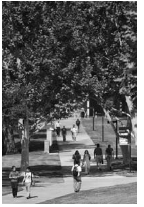
Students at the quad

CSUSB observes the following paid holidays: