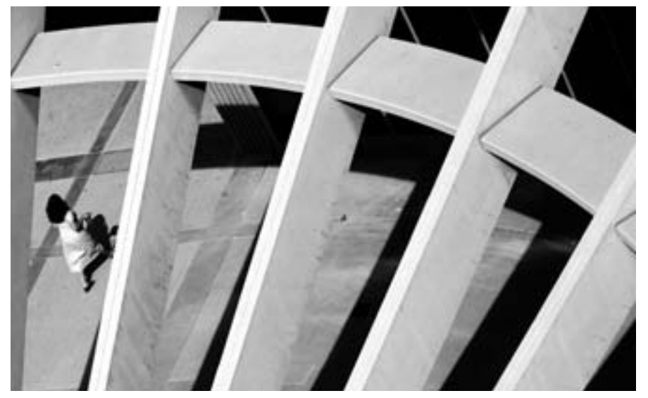
Looking down from the Pfau Library

CSUSB provides paid accrued sick leave to all eligible employees for periods of temporary absence due to personal illness or injury; disability related to pregnancy; exposure to contagious disease; dental, eye or other physical or medical examinations or treatment by a licensed practitioner; illness or injury in the immediate family not to exceed five days in any calendar year; death of a person in the immediate family. CSU Collective Bargaining