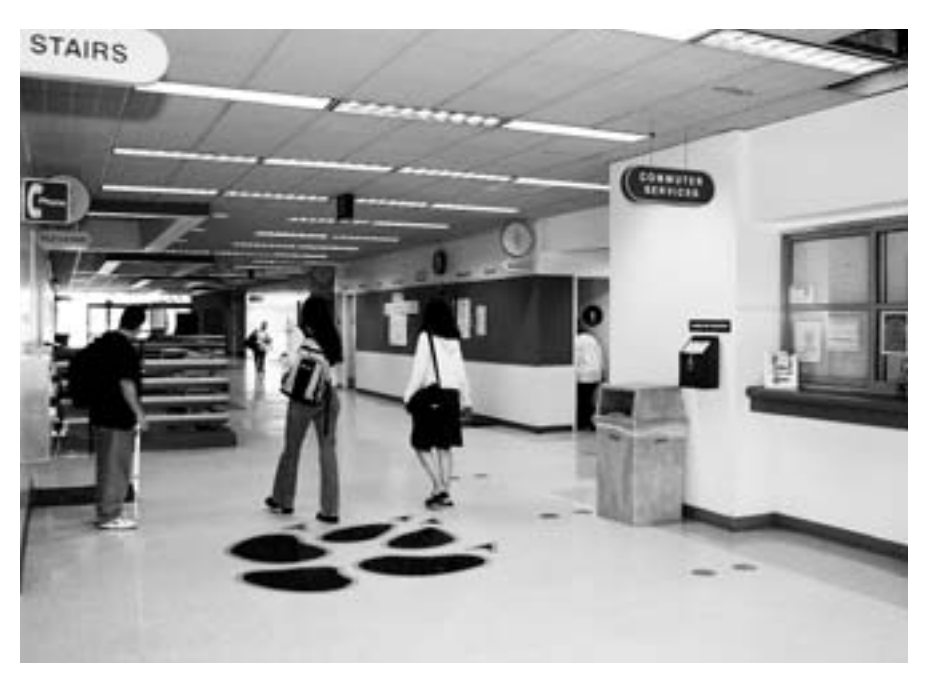
Inside University Hall

You must provide CSUSB with reasonable advance notice, normally 30 days in advance, of your need for a pregnancy disability leave. In addition, you must provide CSUSB with a health care provider's statement certifying the last day you can work and the expected duration of your leave. Contact Human Resources to obtain the necessary forms.