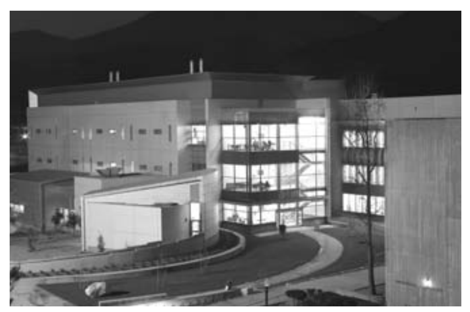
Chemical Sciences Building

If you have a potential grievance or complaint you are encouraged, whenever possible, to resolve it informally with your immediate supervisor. If resolution is not possible on an informal basis, you may elect to file a formal grievance or complaint with the appropriate administrator, in