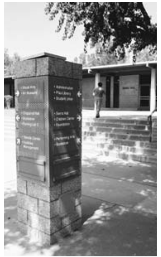
Sierra Hall, Human Resources Office

For vehicle safety, please remember to lock your vehicle, and upon returning to your vehicle, check your surroundings for suspicious persons. Remember to immediately report any suspicious person or circumstances to the campus police.