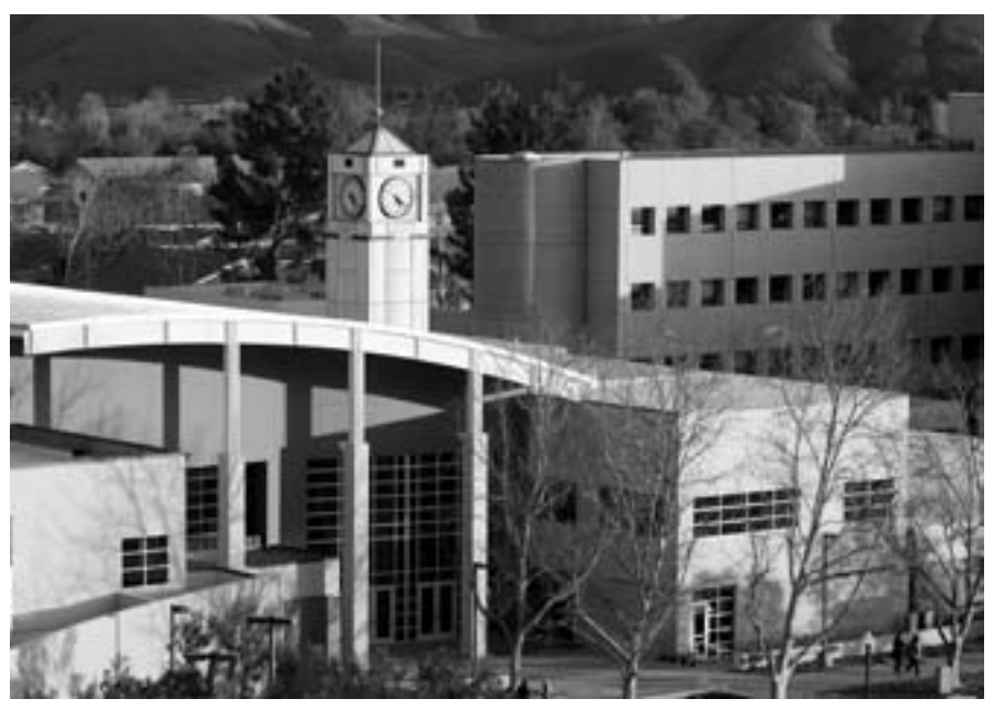
The Santos Manuel Student Union

Employees at CSUSB are classified as full-time, part-time, permanent, temporary, hourly, exempt or non-exempt.